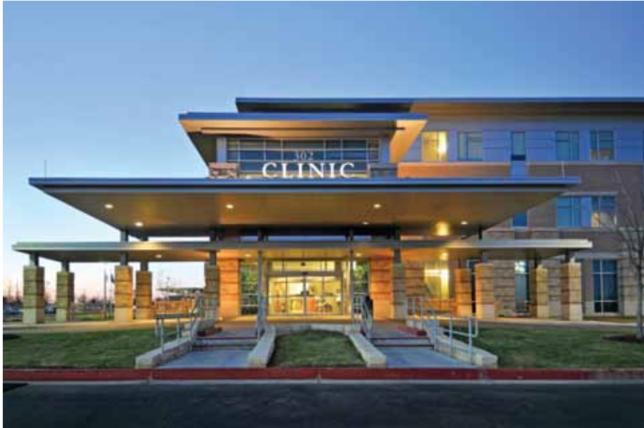
University Medical Campus Clinic Round Rock, Texas