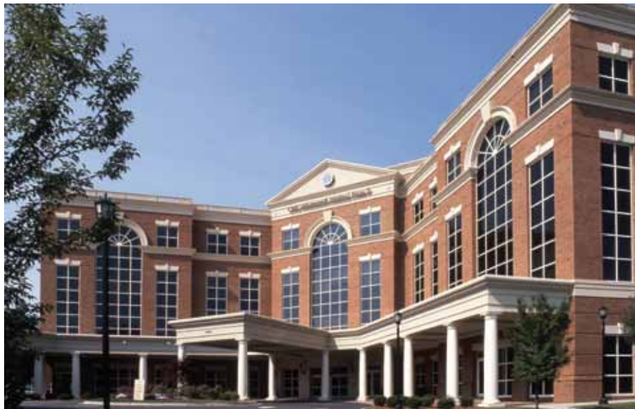
Morrocroft II Charlotte, North Carolina