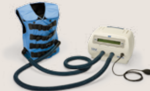
HILL-ROM® RESPIRATORY CARE