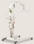
LIKO® PATIENT HANDLING