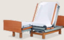
VÖLKER™ BED SYSTEMS, FRAMES AND SURFACES