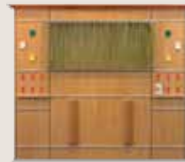
HILL-ROM® PATIENT ENVIRONMENT