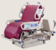
HILL-ROM® BED SYSTEMS, FRAMES AND SURFACES