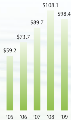
Sales (in millions of dollars)