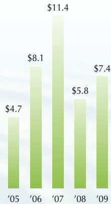
EBITDA (in millions of dollars)