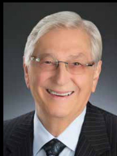
WILLIAM S. BOYD